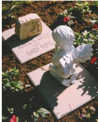
Caroline’s Kids “Garden of Angels”