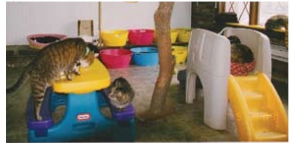
Adoption Room “Park”